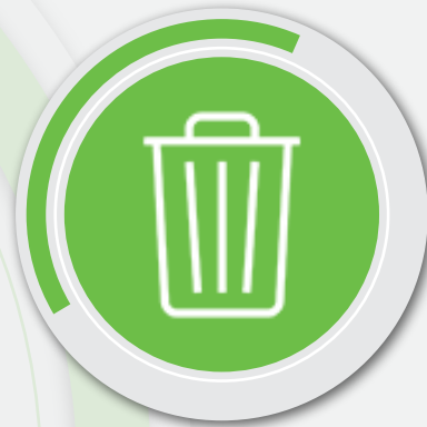
Waste & Sewage Management