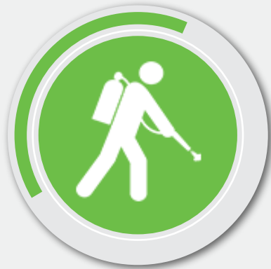
Pest & Rodent Control